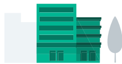
For Medium-sized Companies